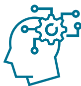
Finding the Brilliant in the Absurd: Design Thinking for Libraries