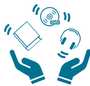
Mastering the Juggle: Flexible Collection Development