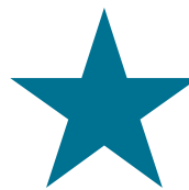
Show Off Your Numbers