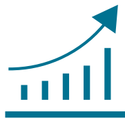
Boost Your Numbers (Panel Discussion)