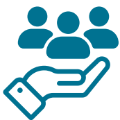
Colorado's Spanish Speakers: Who They Are & How to Serve Them